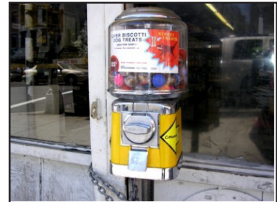
g2tm4 by STINKY Hells Kitchen 47th St and 10th Ave NYC

So I was hanging out on the street looking for something to eat, I'm thinking I need some sweets, beware of the liver biscotie doggie treats..