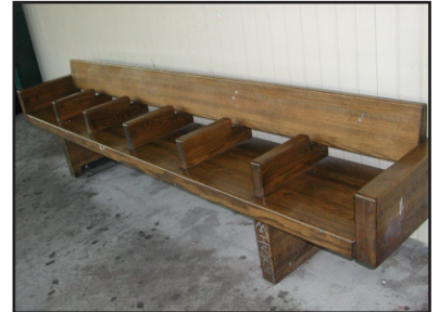
aj021 by insley Hewes and Broadway Brooklyn, NY